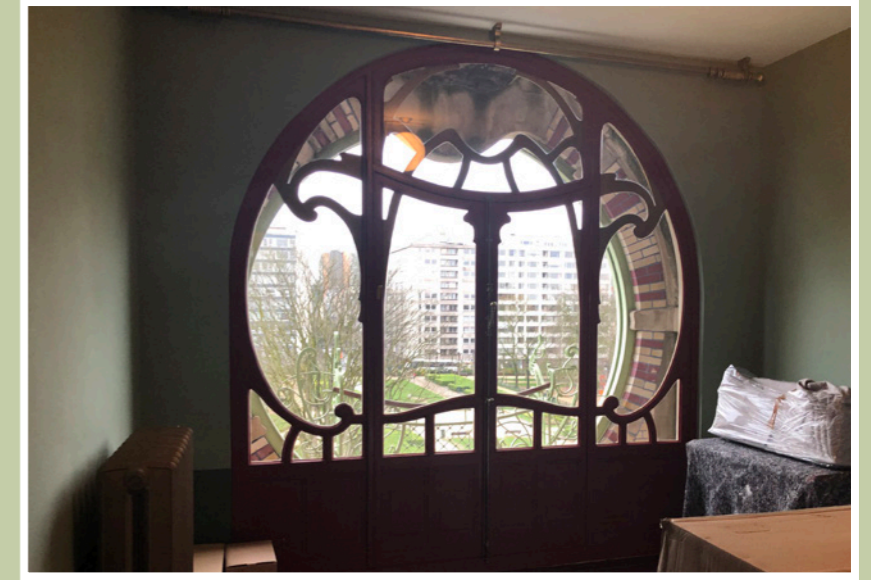
AFTER THE WORKS