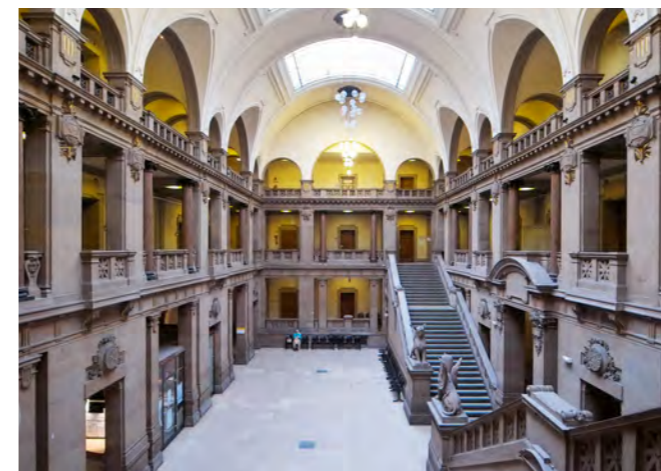
Salle de Pas Perdue in original style