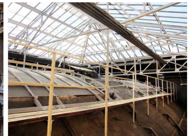
Existing roof iron structure

Contested between France and Germany at the end of 19th century and subject to the German rule after 1870, Strasbourg is marked by one of the largest and perhaps the best urban extensions built by the Germanic urban culture, namely the Neustadt. The "Palais de Justice" was built between 1894 and 1897, according to the project of the Danish architect Skjöld Neckelmann who designed it in neoclassical forms with the aim of representing the equilibrium and composure of justice. The building -listed as a historic monument since 1992 -had already undergone numerous transformations and adaptations during the past decades, in order to increase its areas and functions, which have partly altered the original idea of the project, occupying a part of the court with new extensions and the roof with an additional storey.