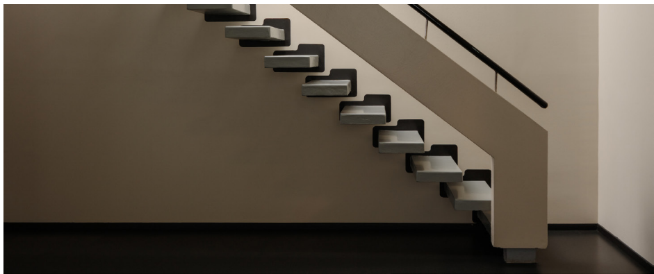
Stairs with painted details conserved. Original materials reinstalled.