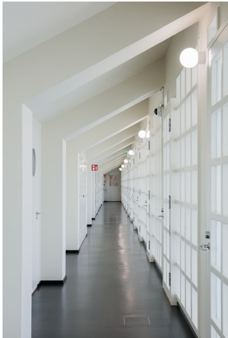
Conserved corridor space from the 1930s.