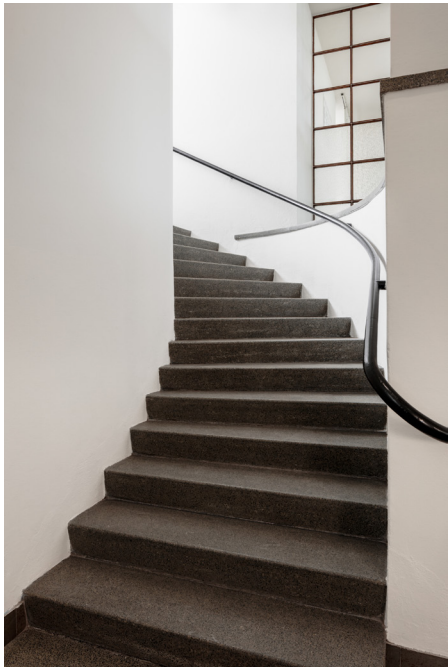
Presidential stairs after refurbishment.