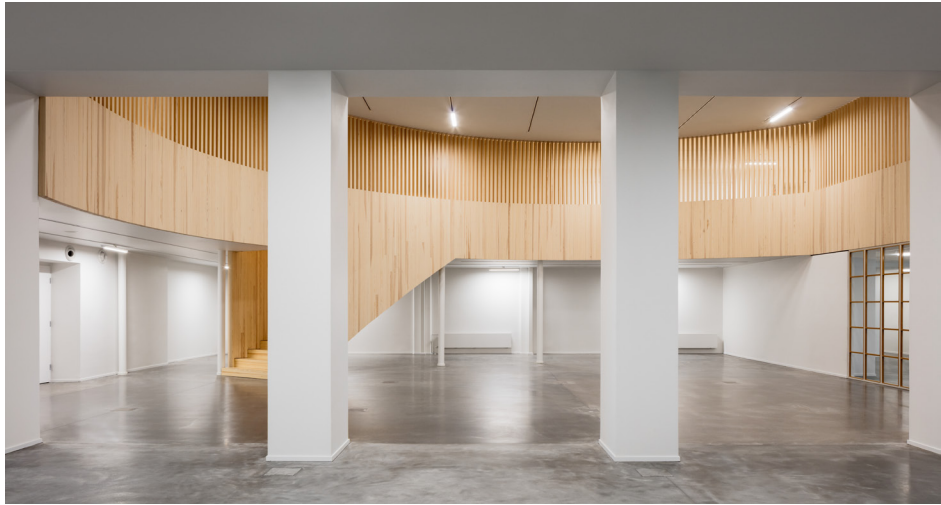
View from the refurbished Sport museum.