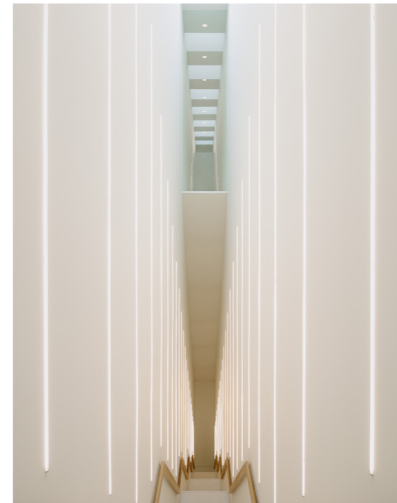
The long linear staircase connects the new exhibition halls at the first floor to the ones located at the top floor