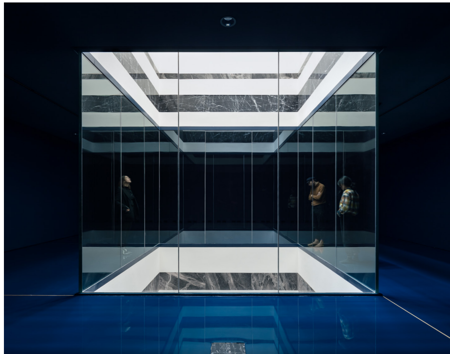
The dark cabinets exhibition space, part of the 21st-century museum