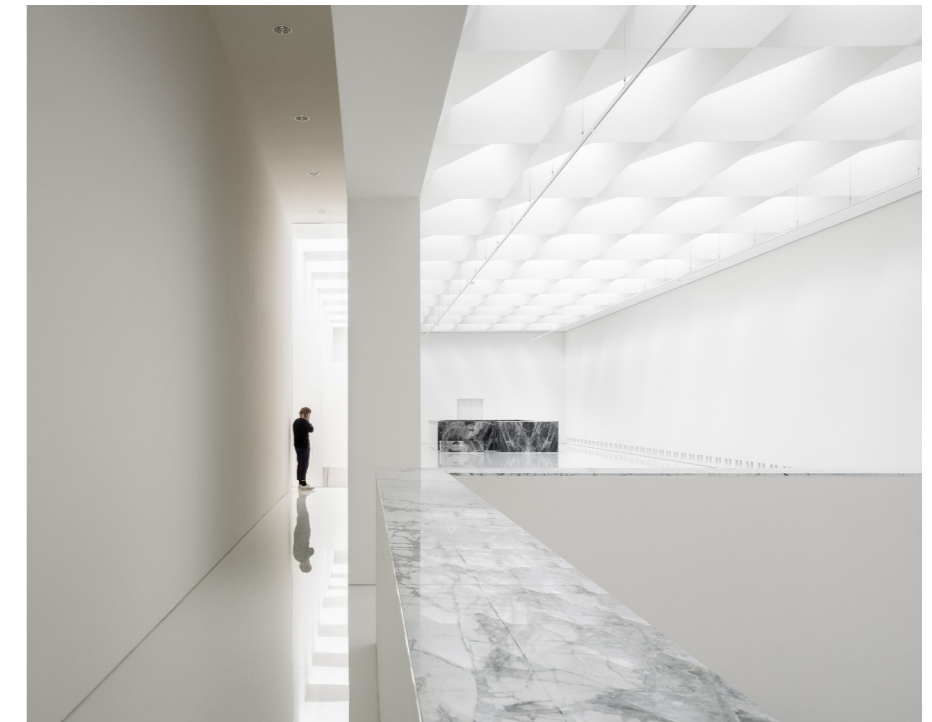
21st-century museum exhibition hall