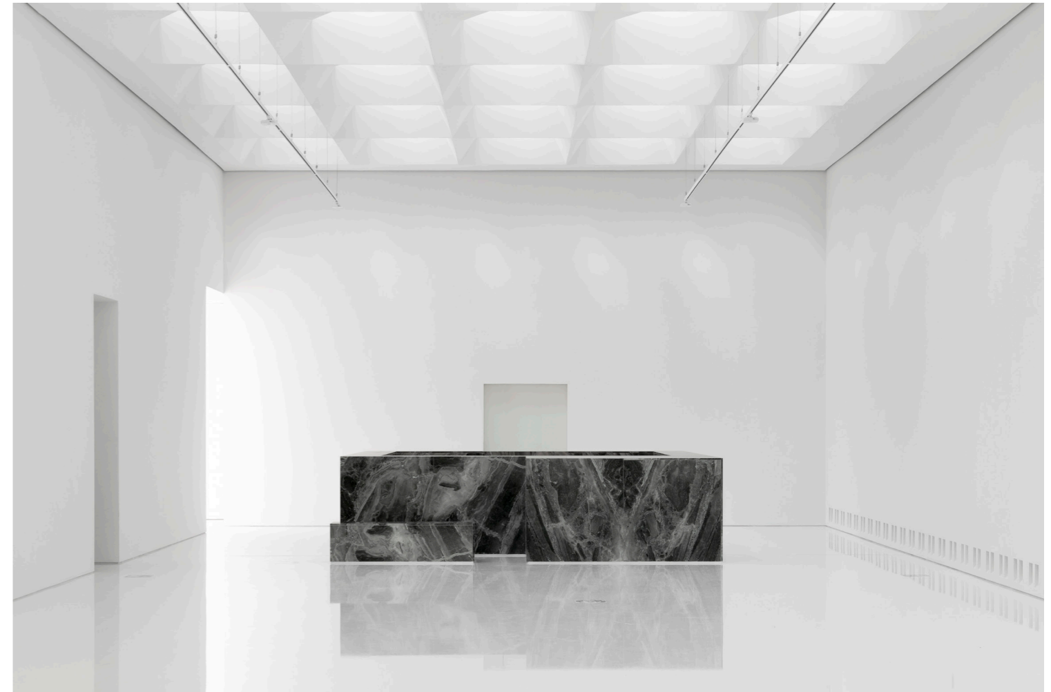
21st-century museum exhibition hall