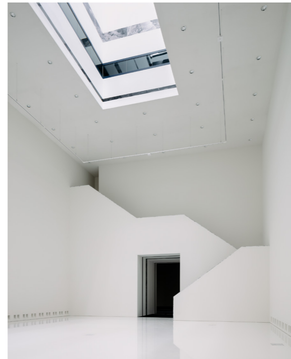
21st-century exhibition hall featuring a monumental staircase leading to the upper exhibition spaces. Above, one of the four large lightwells vertically connecting the space to the 3rd level and the skylights