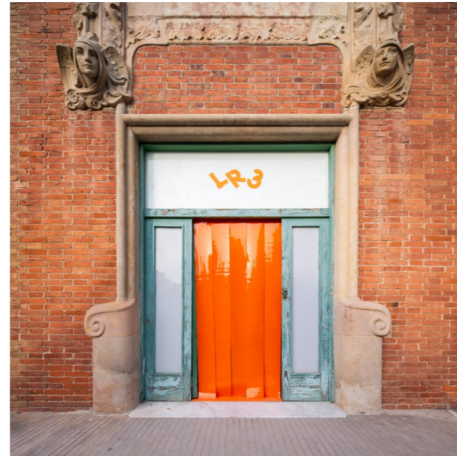
A bright orange curtain has been used to enhance the contrast to the delicate ornamentation of Sant Pau's floral motifs and to transmit the idea of access to the oneiric world that the LR3 invites us to.

The project emerged from the desire to present the new collection of the fashion brand LR3, merging virtual and digital reality with the physical one. The approach consists of creating an ephemeral space located inside the pavilion of Nuestra Señora del Carme, in the modernist complex of Sant Pau, designed by the architect Domènech i Montaner. The access to the pavilion is from the north side of the old hospital, and naked, pixelated avatars serve as a lure to the experience.