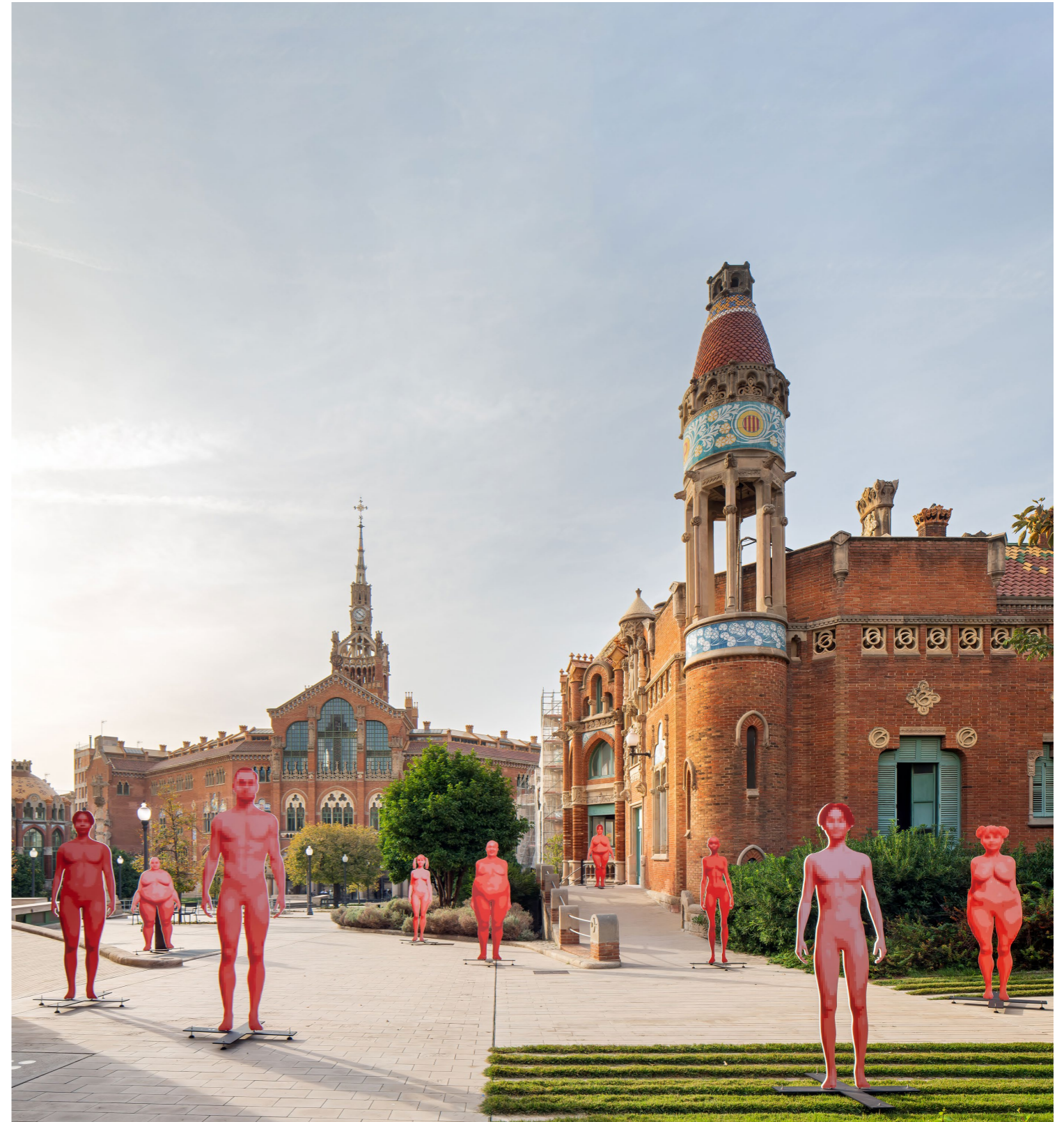
The arrival to the pavilion during the day is surrounded by a number of naked bodies, who will accompany us during the whole experience. These figures are settled on an adaptable base, in order to be reused on future events.