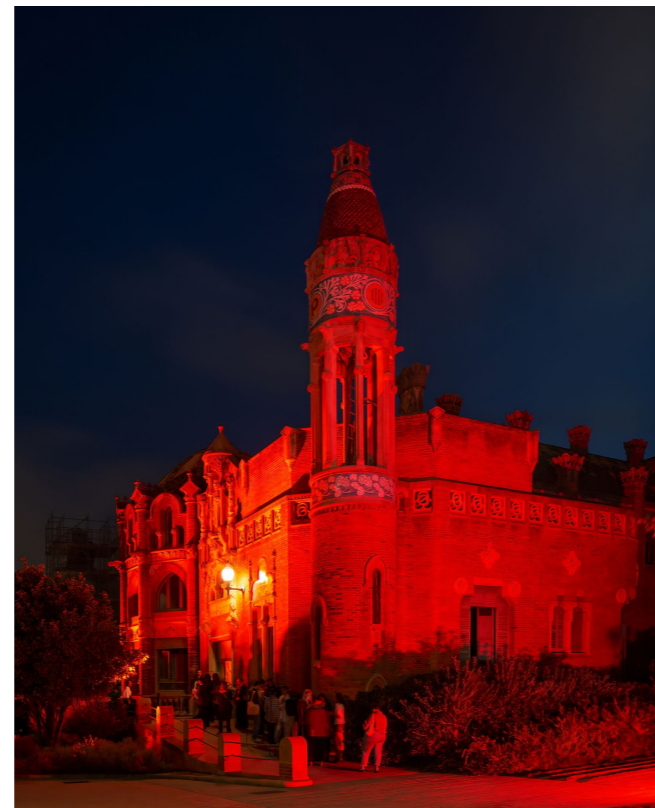
The brand-colour night lightning allowed us to create a contrast with the rest of the buildings, without affecting the pavilion or the surroundings in anyway.

To achieve this, a lightweight self-supporting structure has been installed that respects the original shell without coming into contact with it, generating an interstitial space that makes evident the separation of the two constructional worlds while providing the access for the installations. This autonomous structure is made up of three different environments and has been lined on the inside with white fabric tarpaulins stretched with a system of modular canvases. The entrance to the pavilion is through a small door within the building's original abraded wooden carpentry.