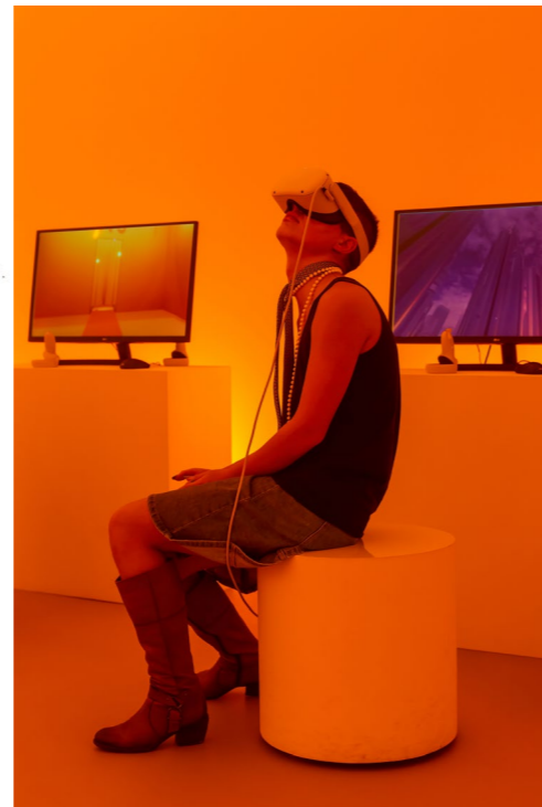
Here, you have the option to immerse yourself in the virtual experience, where the viewer is transported to the brand's universe and learns about its new collection.