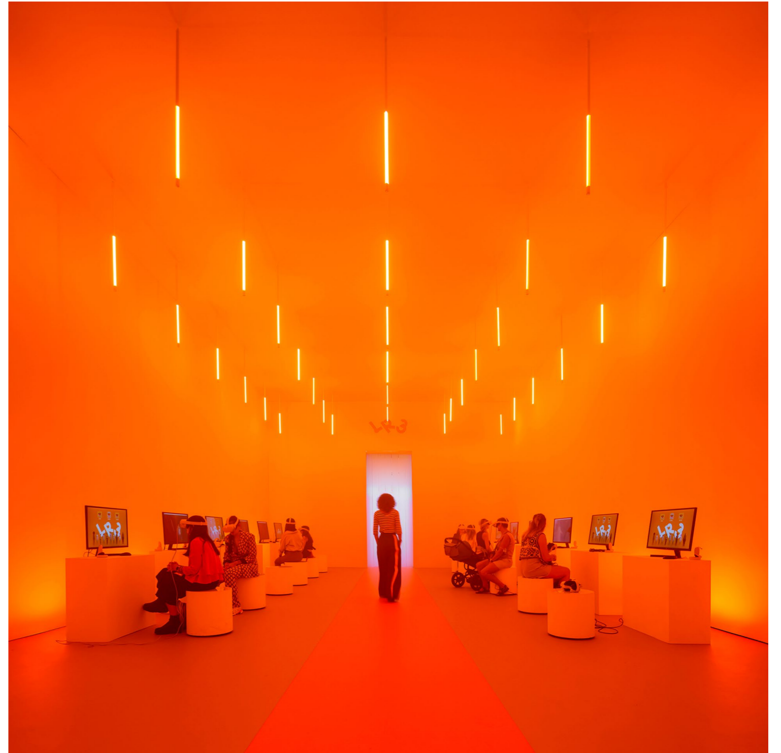
Once inside the pavilion, you enter the first space which bathes in an orange overhead lighting that tints the white tarpaulins with the representative colour of the brand. The possibilities offered by the original space, in relation to the goals of the brand, resulted in a proposal of 50 linear meters of non-glued carpet. Basically, the project was a big runway. The use of this solution allowed the brand to remove the floor system once the event finished and reuse it in future expositions.