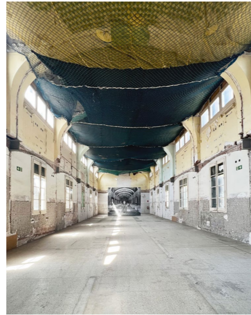
Current state of the pavilion. One of the last buildings still to be refurbished in the modernist enclosure of Sant Pau.