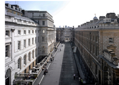
Photograph of existing deck