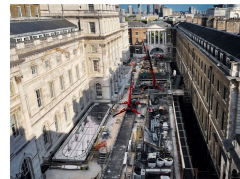
Photograph of glazing to north lightwell installation

The Quadrangle Project brings a building that occupies an unusual, constrained space back into use as a new engineering department. Situated entirely within a Grade I listed site within the Strand Conservation Area, the roof of the building forms the Quadrangle of the founding campus of King's College. The Quadrangle provides access to 4 buildings including The King's Building and the east Wing of Somerset House, a context requiring high quality, thoughtful design. The thermal upgrade was technically demanding, given the need to maintain existing levels to this roof-Quadrangle condition. The design of the Quadrangle re-establishes the 'lost' axis of the original plan for the site by Sir William Chambers.