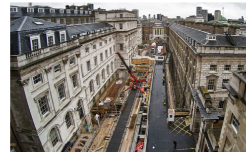
Photograph of forming of concrete lightwell structures