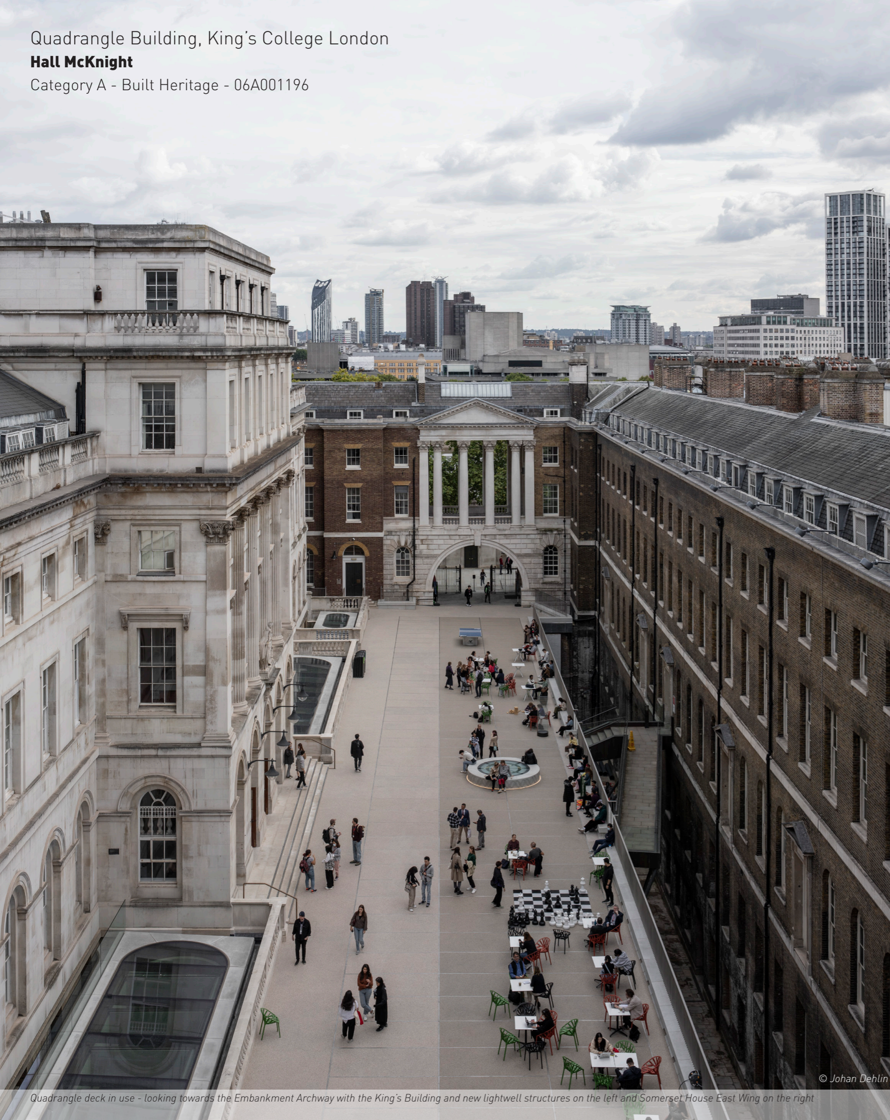
Quadrangle deck in use - looking towards the Embankment Archway with the King's Building and new lightwell structures on the left and Somerset House East Wing on the right