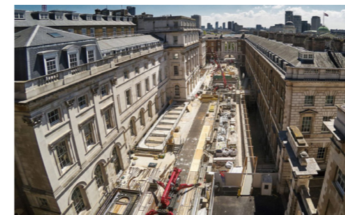
Precast concrete to lightwells being installed