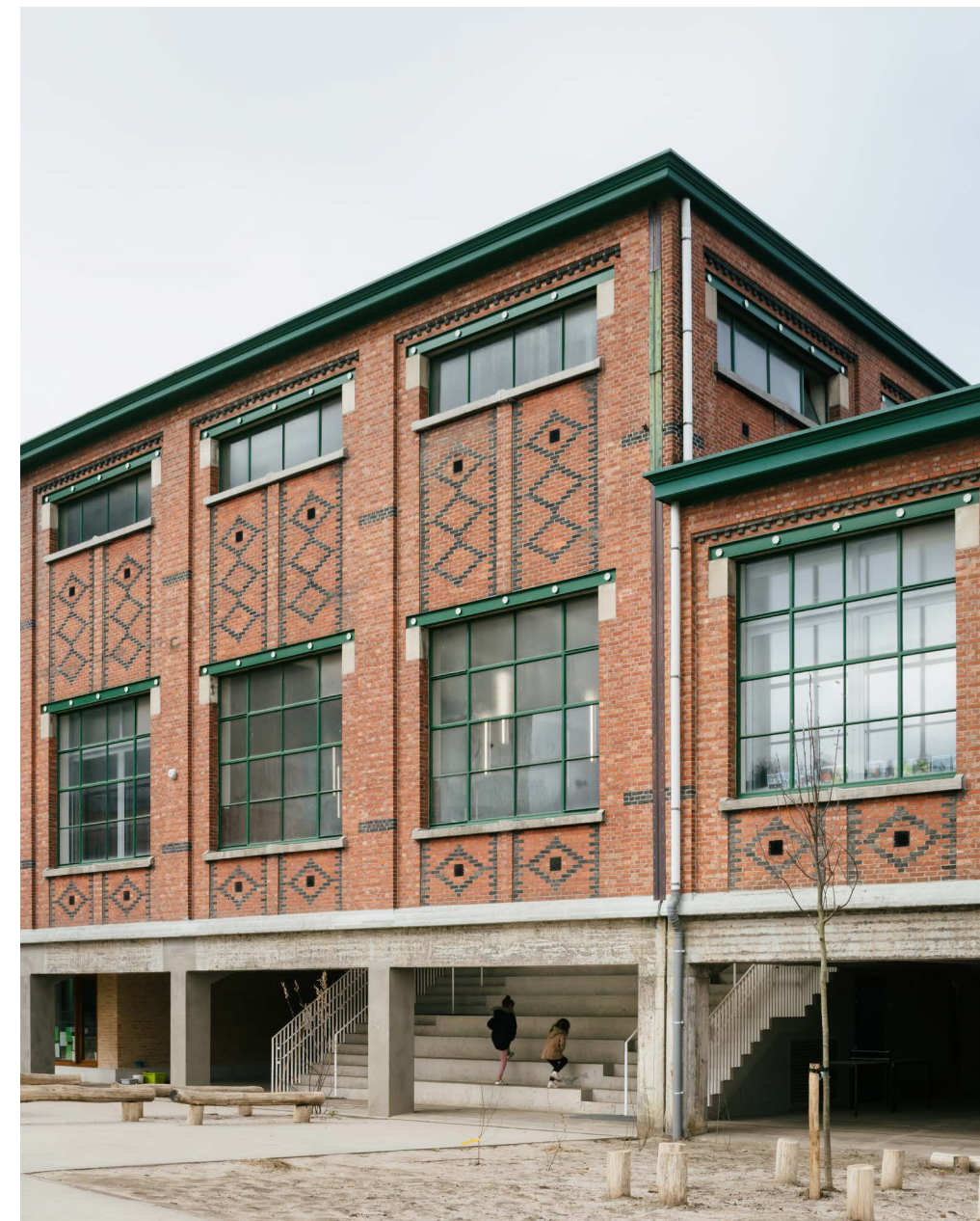
School building with adventure playground and kindergarten classrooms on the ground floor