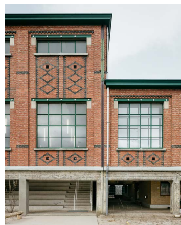
New situation exterior