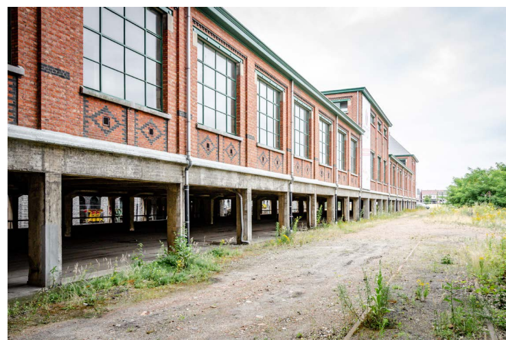
Previous state exterior