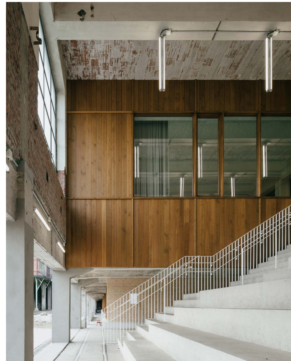
Generous new staircase as entrance to primary school