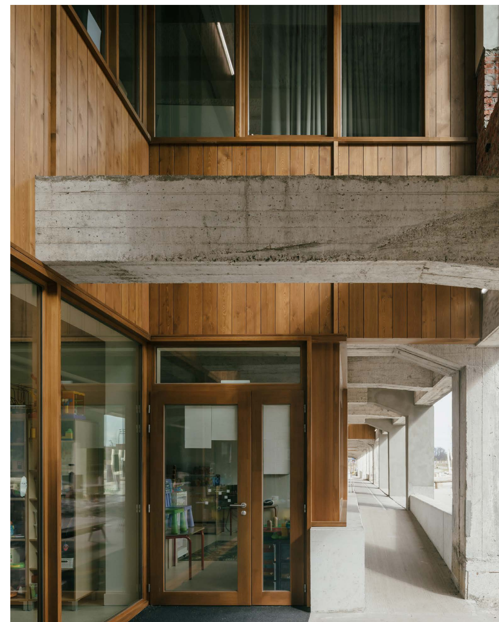
Circulation under the building for nursery classes