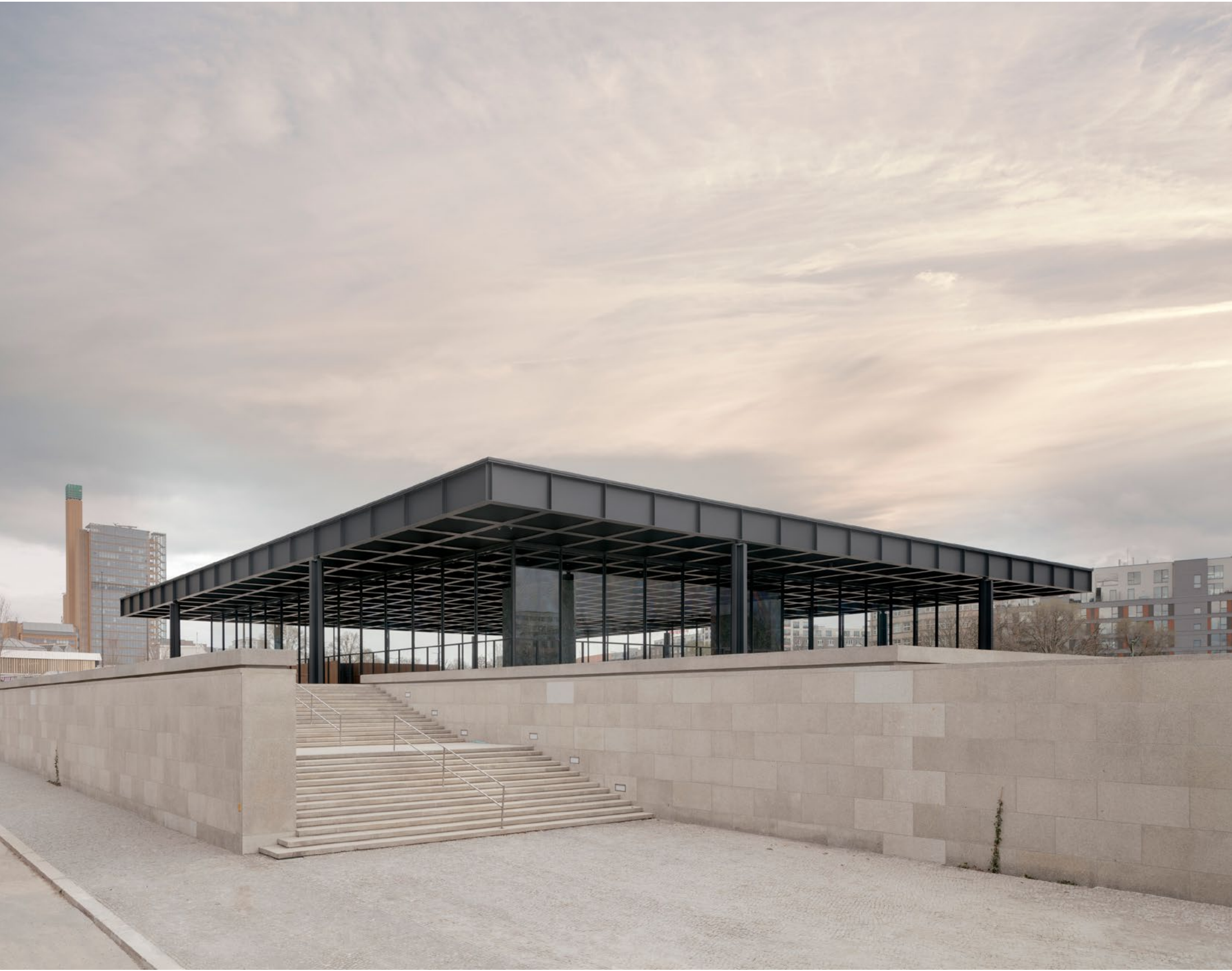
Neue Nationalgalerie – View from Sigismundstraße