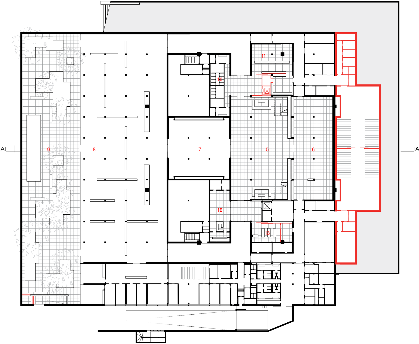
Lower ground floor plan 1:750