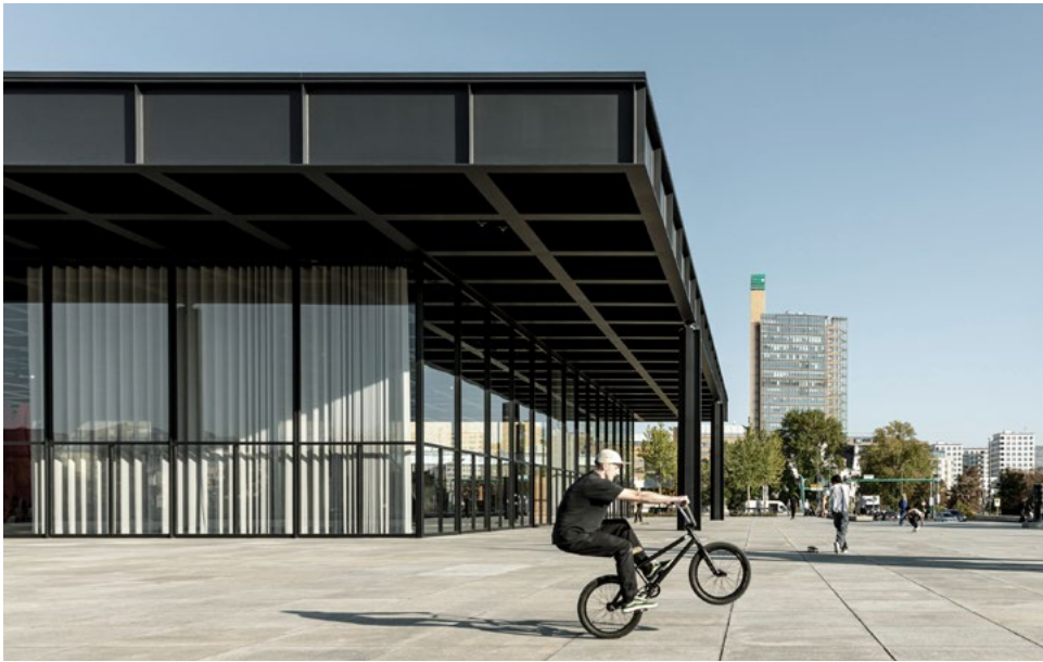
Steel and glass façade, © Ute Zscharnt for David Chipperfield Architects

Planning options 2 and 3 were discarded because the interventions would have profoundly changed the historic structure. A far-reaching energetic retrofitting was therefore renounced in favour of preserving the existing appearance.