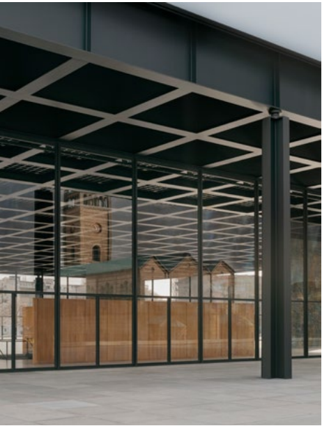
Façade detail, © Simon Menges