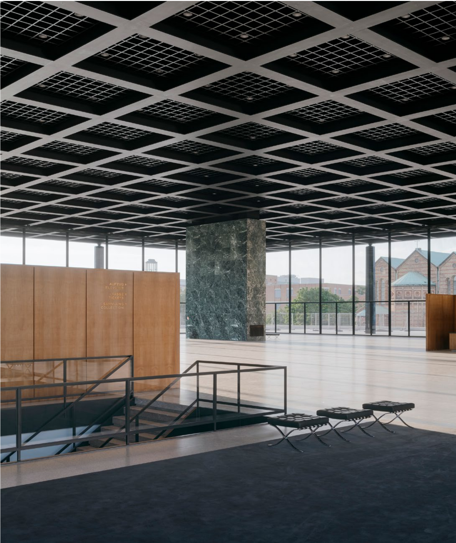
Exhibition hall, © Simon Menges / Ludwig Mies van der Rohe / VG Bild-Kunst, Bonn 2021