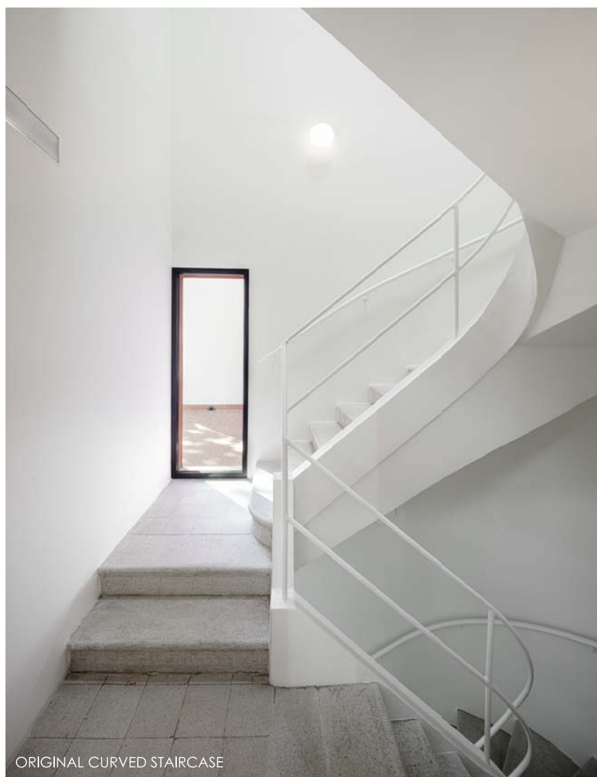
ORIGINAL CURVED STAIRCASE