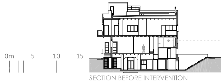
SECTION BEFORE INTERVENTION

The existence of the majority white stucco on the façade and the red of the core of the scale were determined. Also the trace of the original lettering was found under the later applications to the facade and replicated according to the images and foundations.