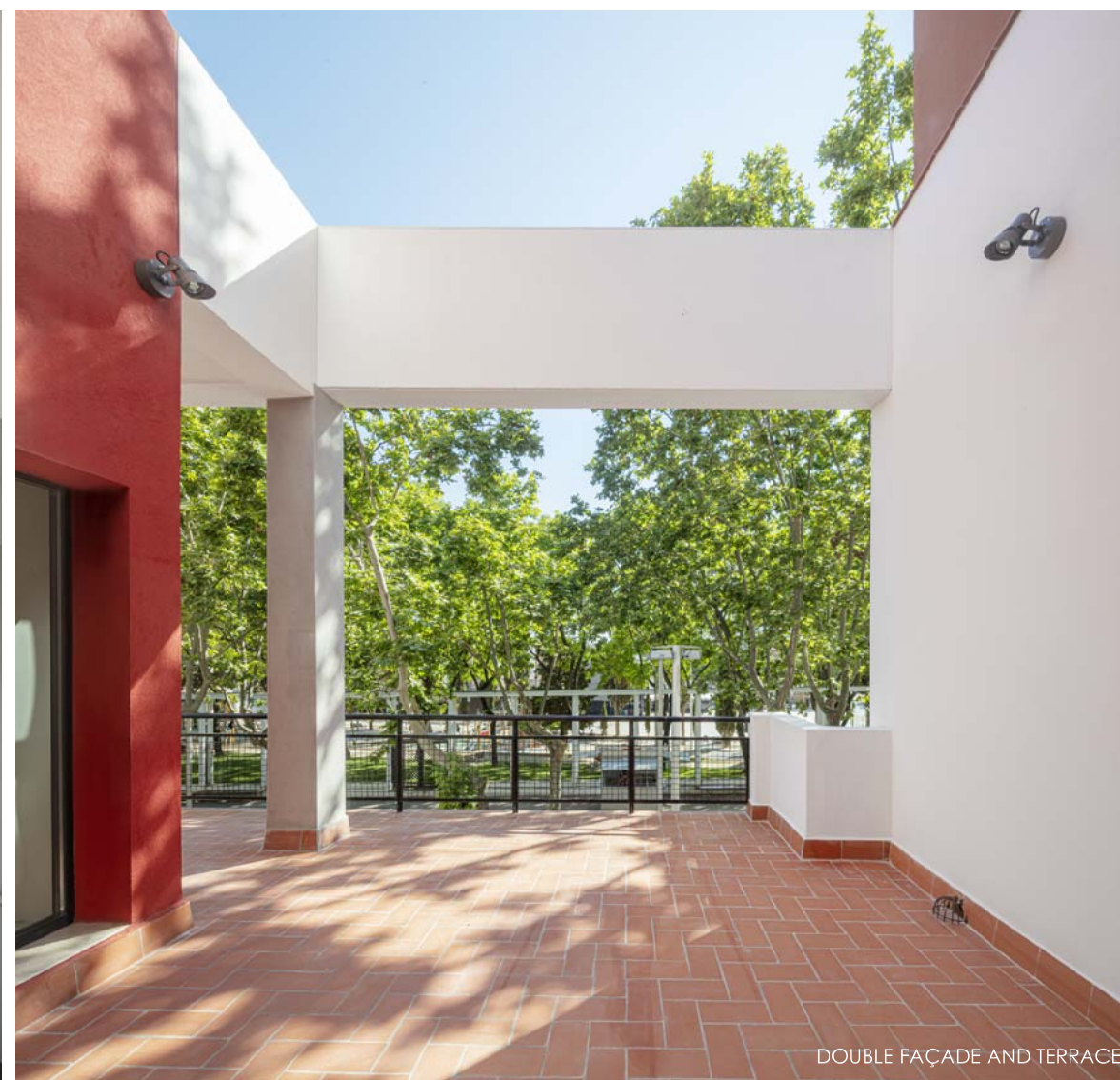
DOUBLE FAÇADE AND TERRACE