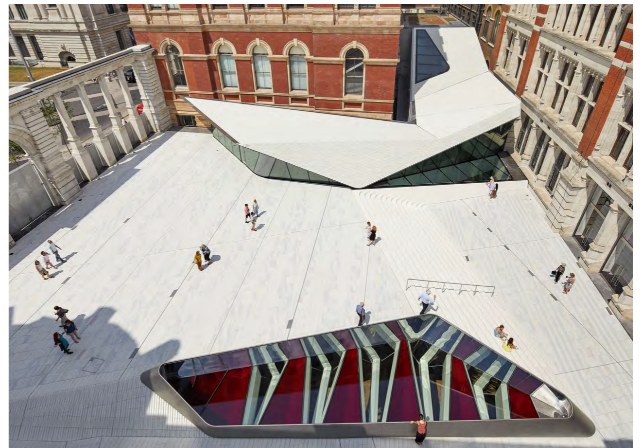
Reflected light from the porcelain tiles lifts the brightness of the historic facades