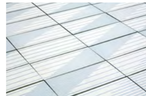
The museum's didactic ethos is played out in the porcelain courtyard and mosaics