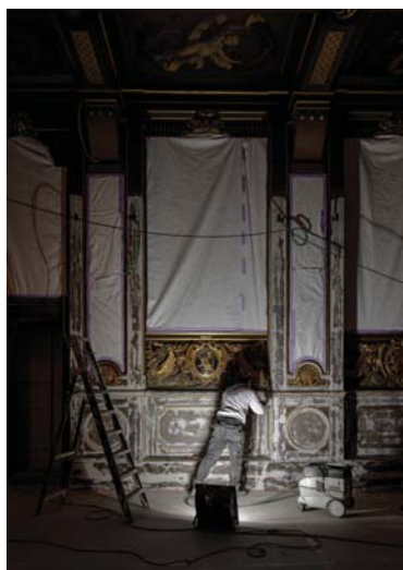
The interior polychromy of the Council Chamber was fully restored and reconstructed based on an extended colour research.