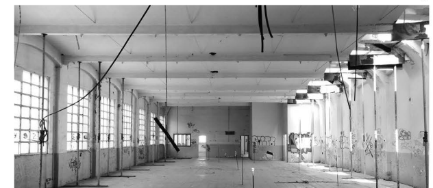
Current State - Central Building