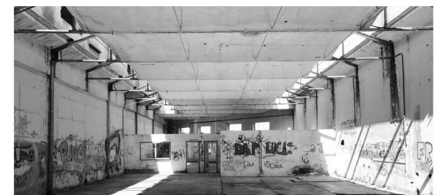
Current State - South Building