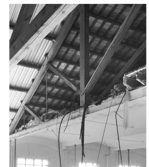
Truss detail and roof elements