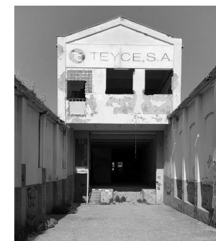
Current State - Central Passage