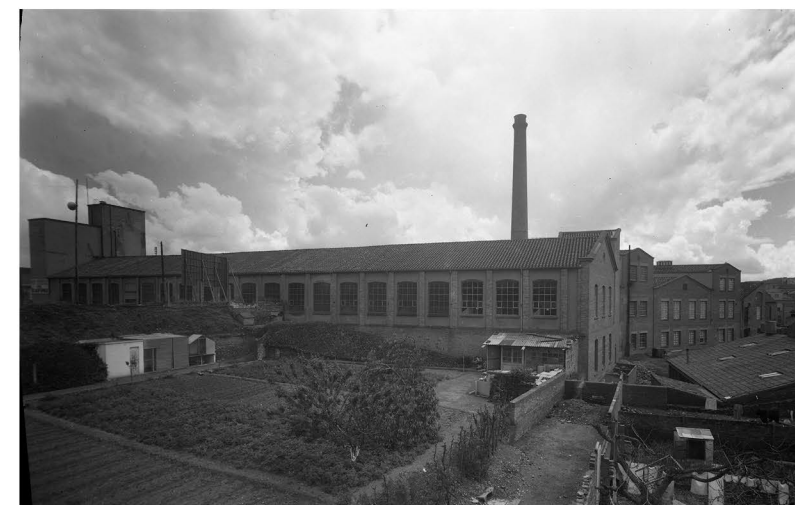
Original State, 1963. Carles Duran i Torrens Collection