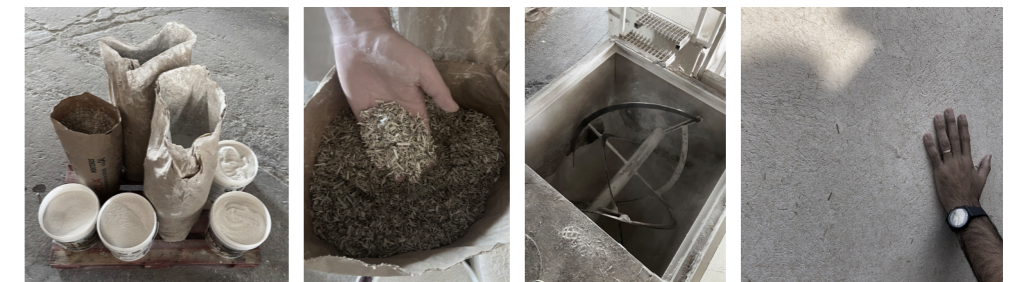
Evoking the connection with the landscape - The lime plaster coating enriched by incorporating hemp fibers