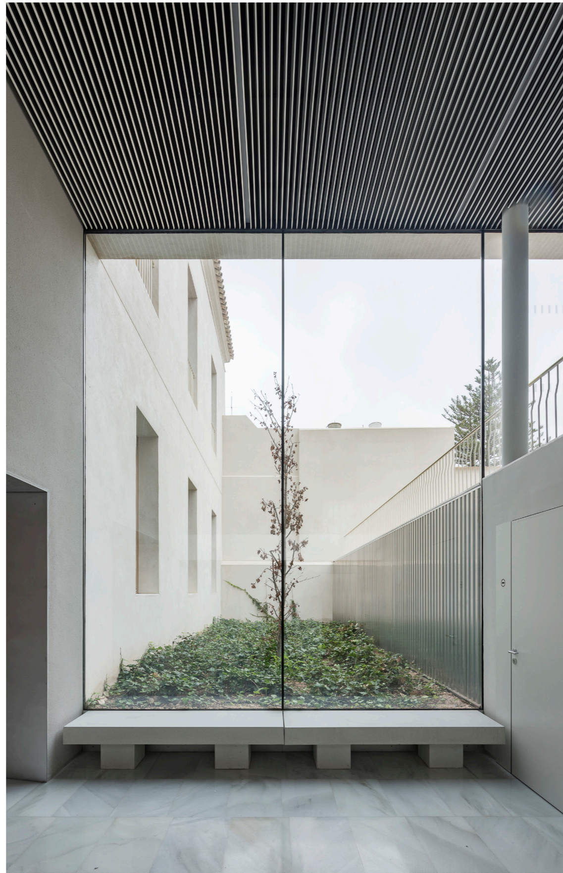
A double-height space recover the rear façade – Minimum contact between the two buildings