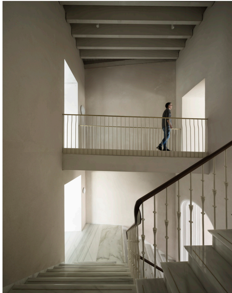
Connection space between the two buildings.