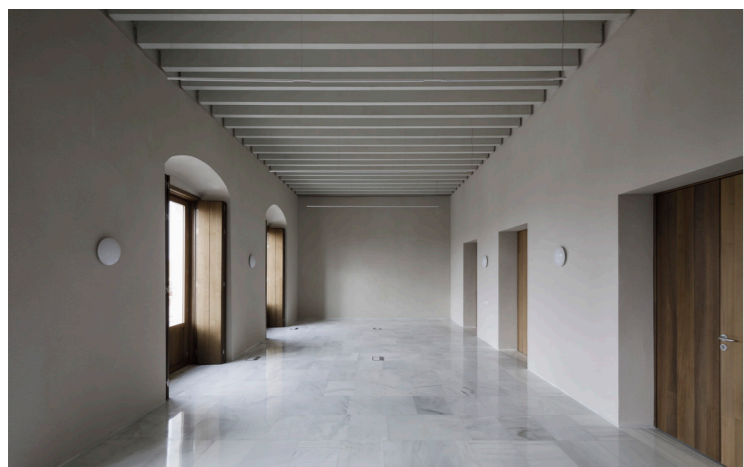
Refurbished workspaces of the Neoclassical building - First floor