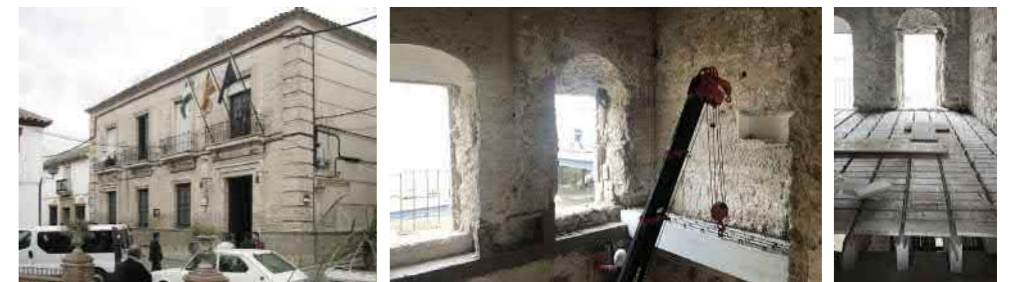
Previous architectural state and process