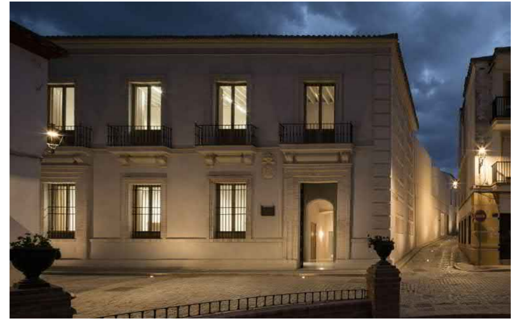
Ancient Town Hall (18th c.) - View from Plaza de España