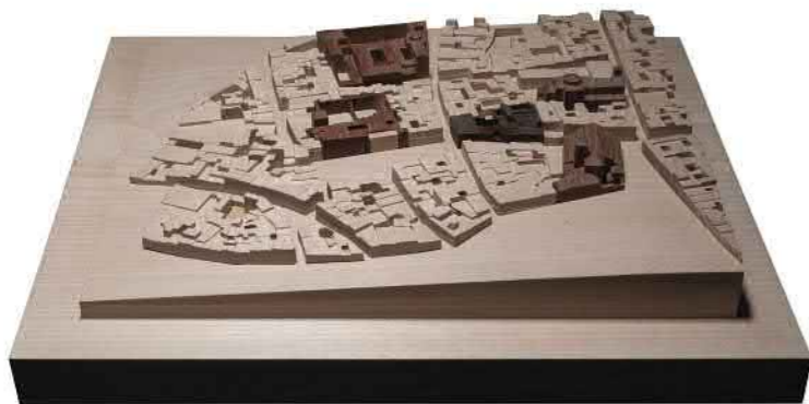
Model of the Protected Heritage of the surrounding area

The extension integrates perfectly with the existing neoclassical structure, also refurbished, surrounded by protected churches and convents. Following the Islamic urban layout, the new building closes off from the street and opens up to the interior; more open and public on the access levels, and with the work spaces concentrated on the upper floors. Much of the materiality is based on natural lime mortars, with plant traces on the facades, evoking this landscape relationship noted.