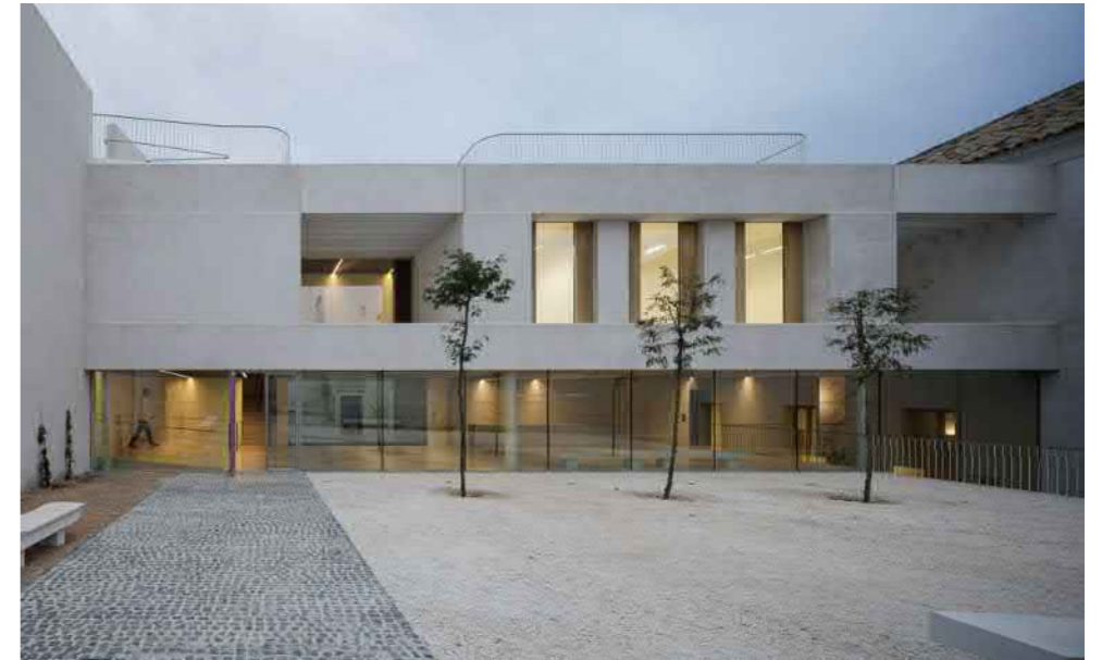
Extension - View from inner courtyard