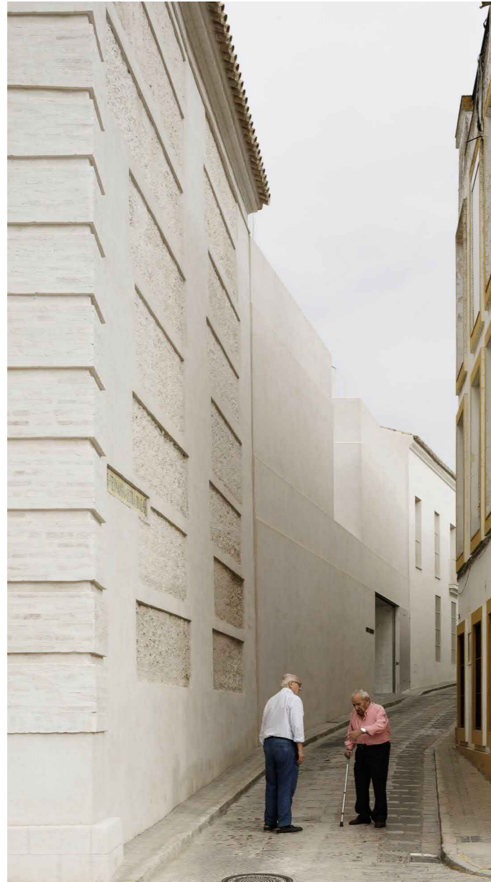
Extension and new access from the street