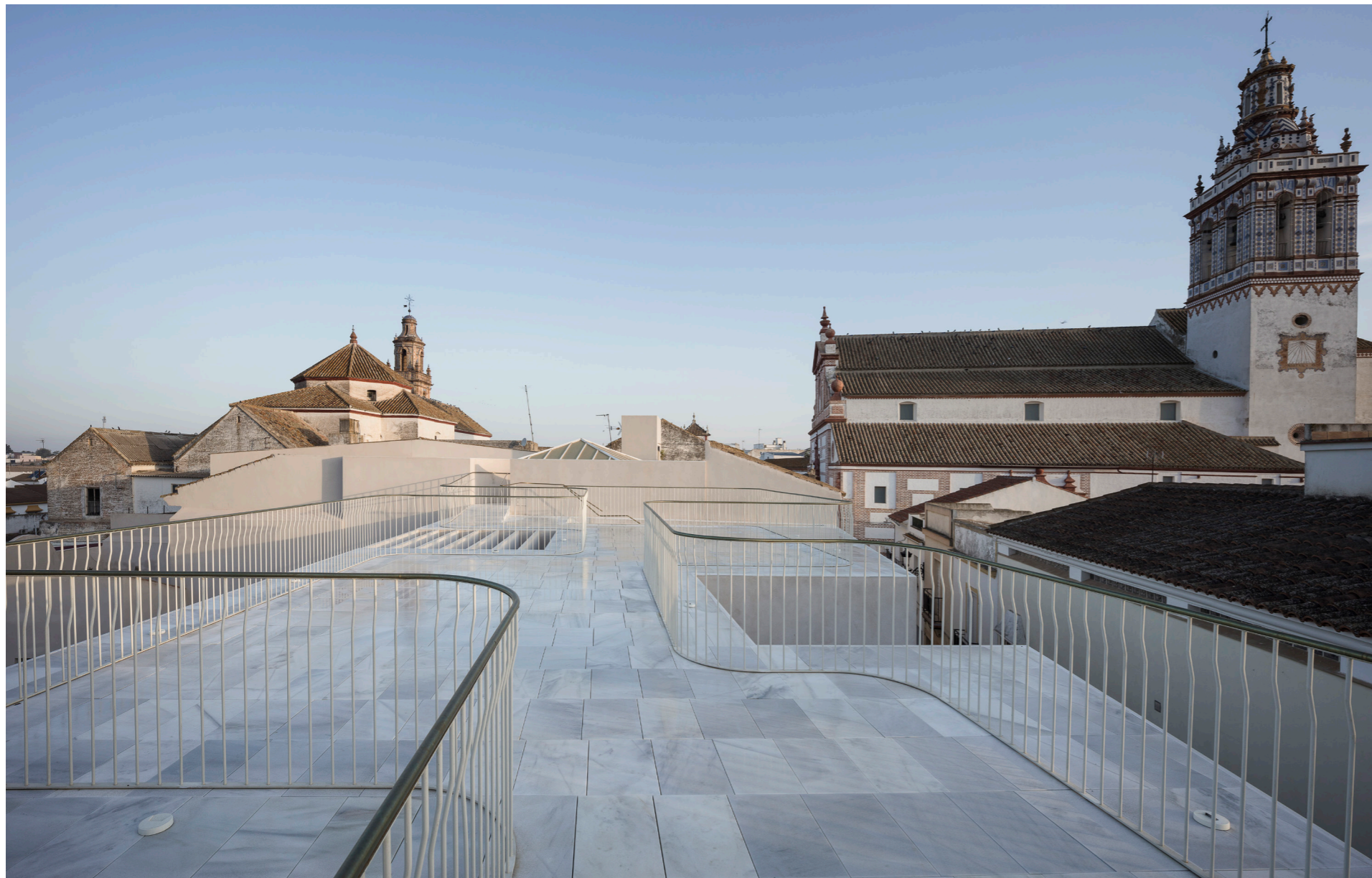
Rooftop public space