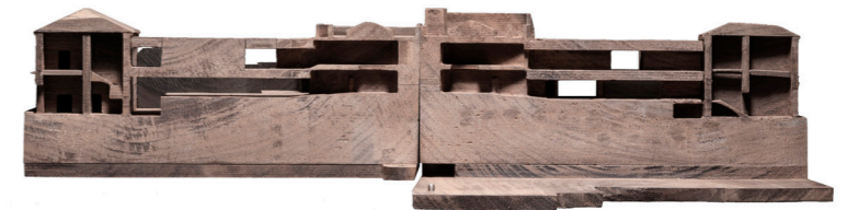
Model - Longitudinal Section showing the relation between buildings and floors