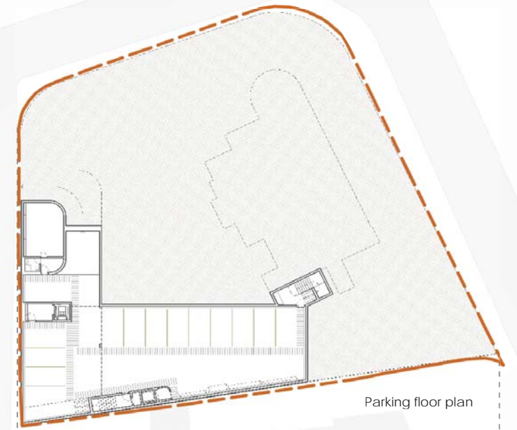
Parking floor plan