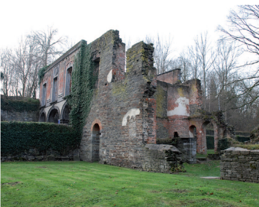
Visitor Centre at the abbey site of Villers-la-Ville | Binario architectes (architecture); Dupaysage (landscape design); L'Escaut architecture (scenography) | Category B – Exterior Spaces