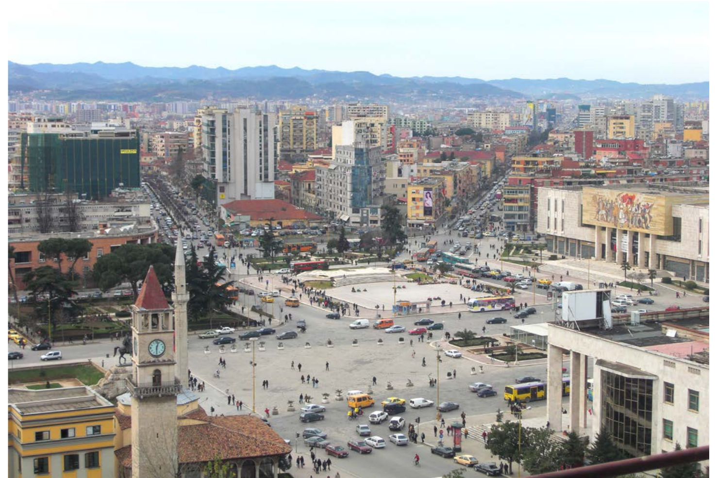
view of Skanderbeg Square, 2008