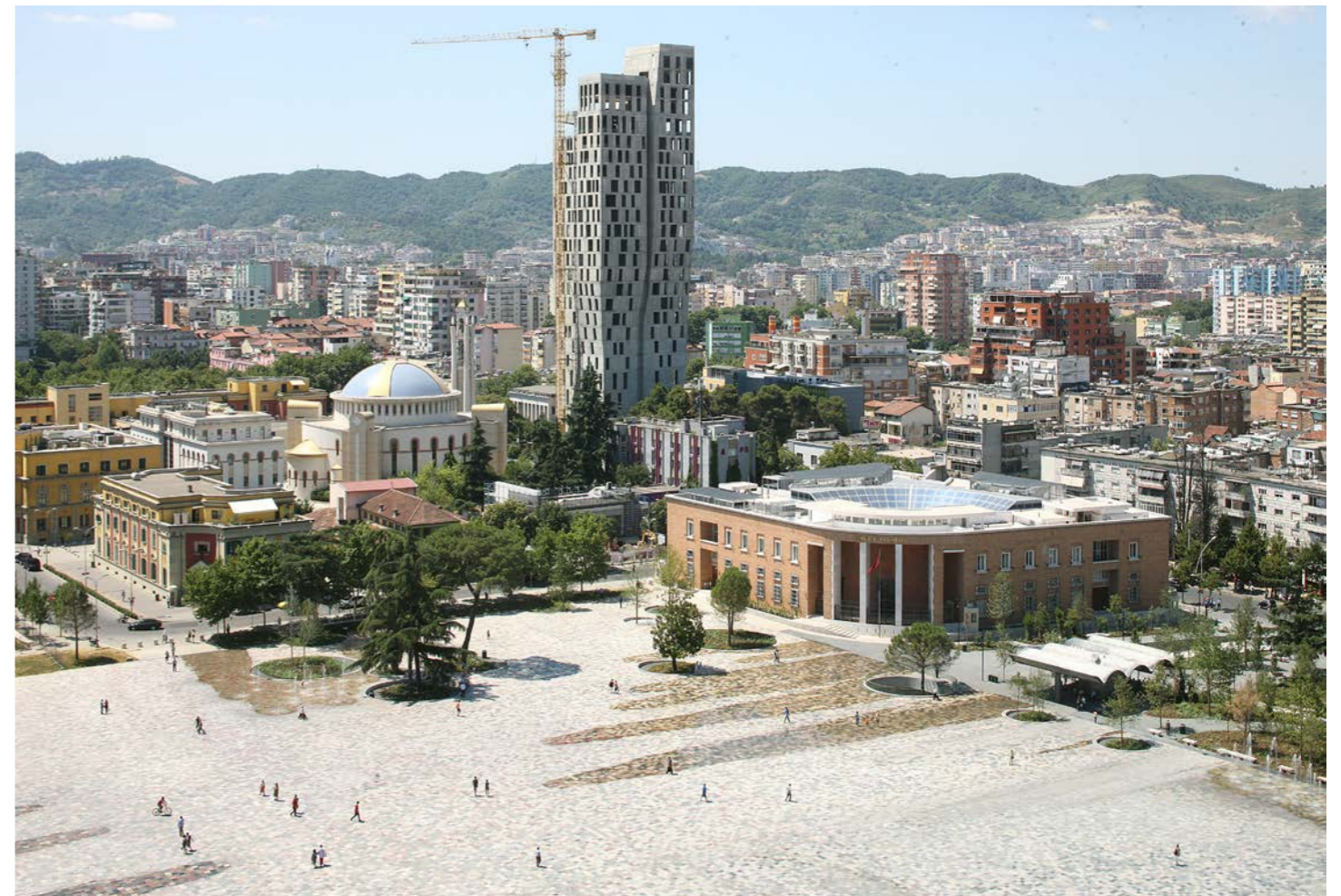
view of Skanderbeg Square, 2017