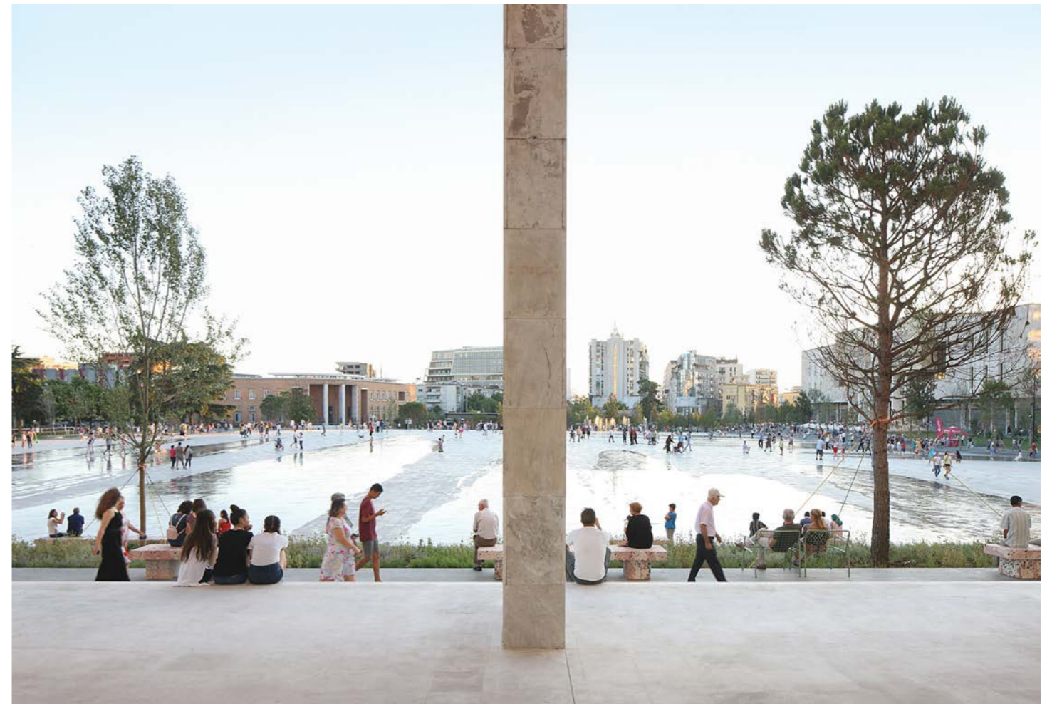
the openness of the square experienced from the National Theater's gallery