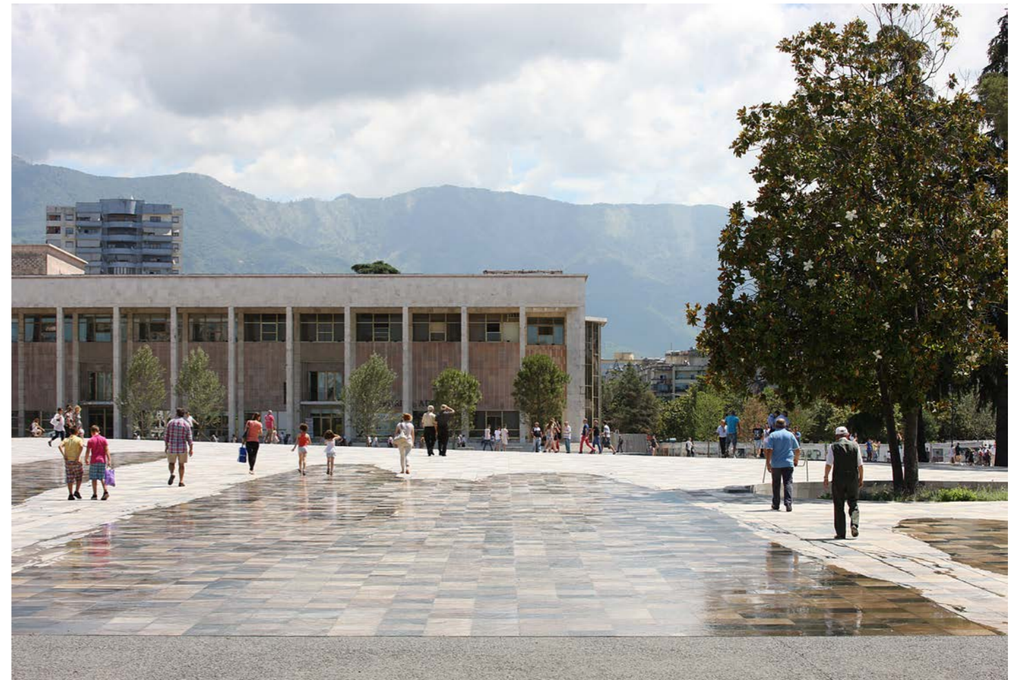
the insertion of a tilted plane unsettles the monumentality of the buildings lining the square in a subtle yet powerful way