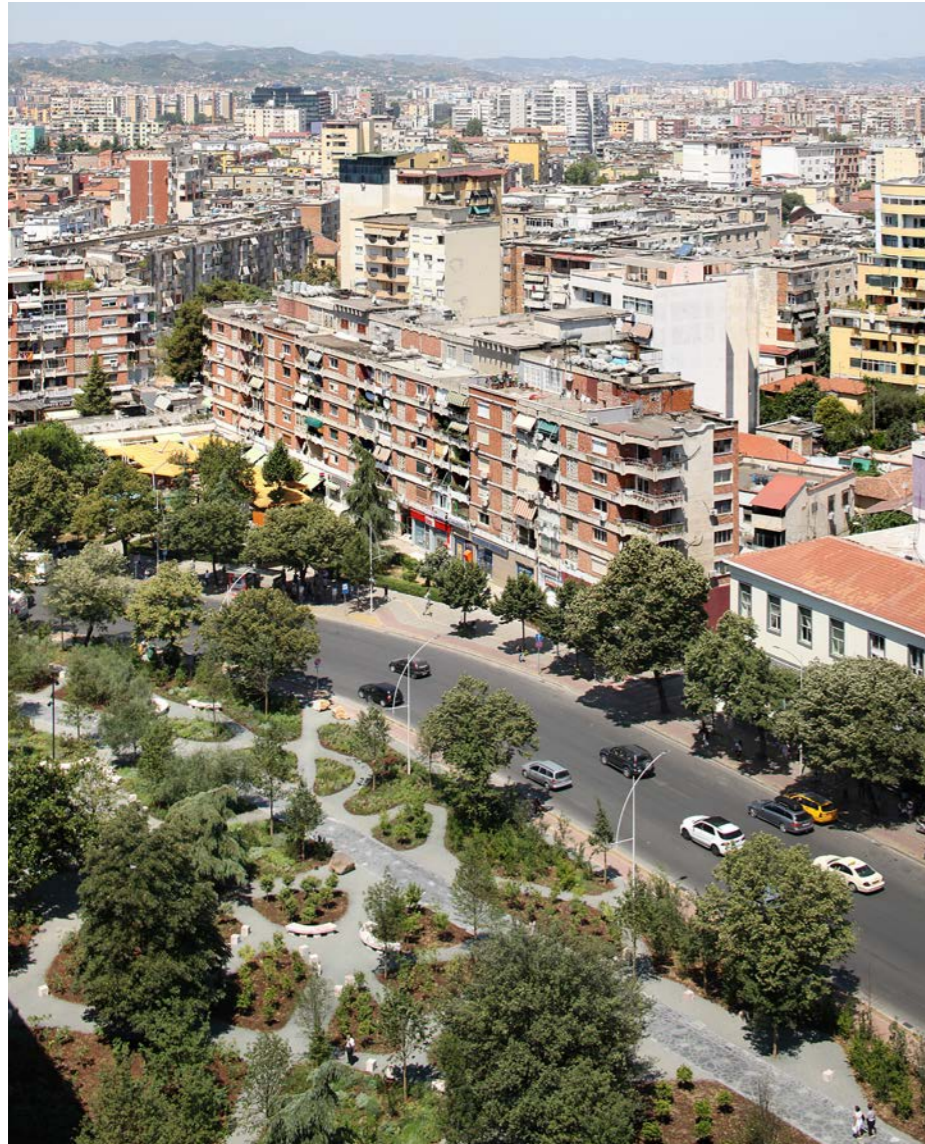
from the dense city to the void, through the 'urban forest'