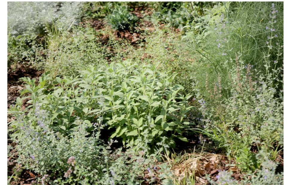
local plants were selected to create functioning, low maintenance biotopes