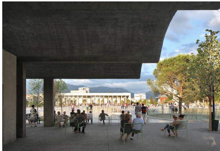
the square as open air living room for Tirana