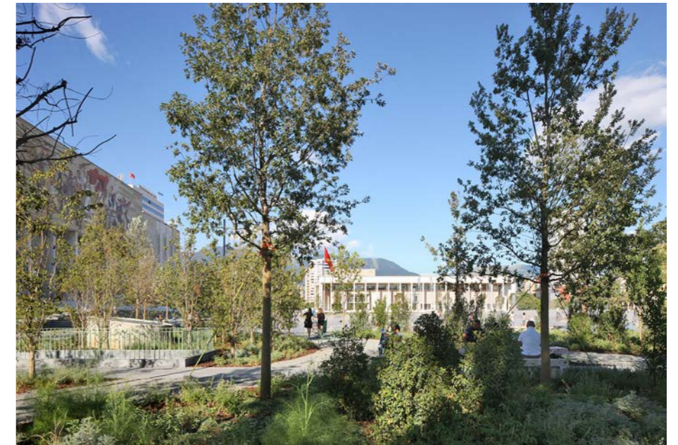
the green belt acts as a veil to be crossed to reach the bright central void