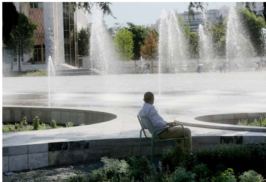
fountains, shade and evapotranspiration offer a naturally cool environment