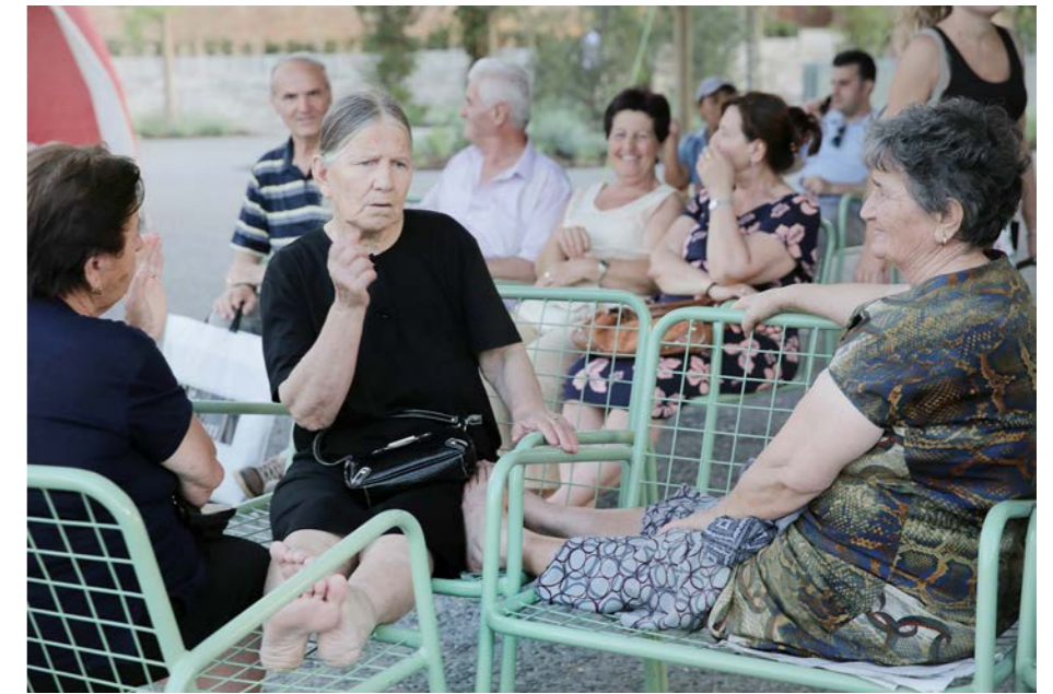
intimacy, made public in the loose urban furniture designed for the project