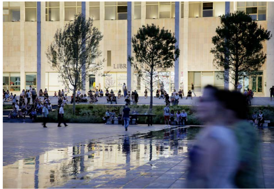
the stairs around the square were redesigned to offer a new amenity