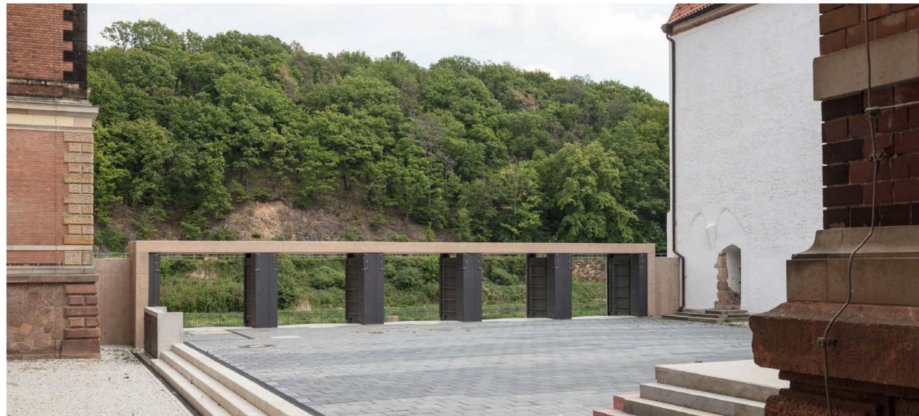
Loggia protecting the courtyard of former cloister