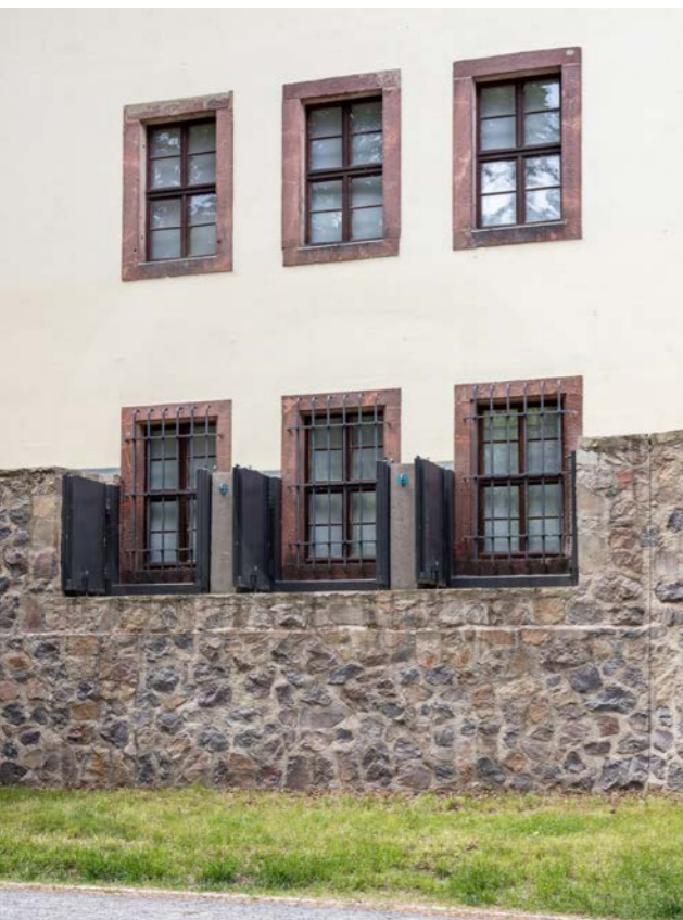
City museum, retrofitted