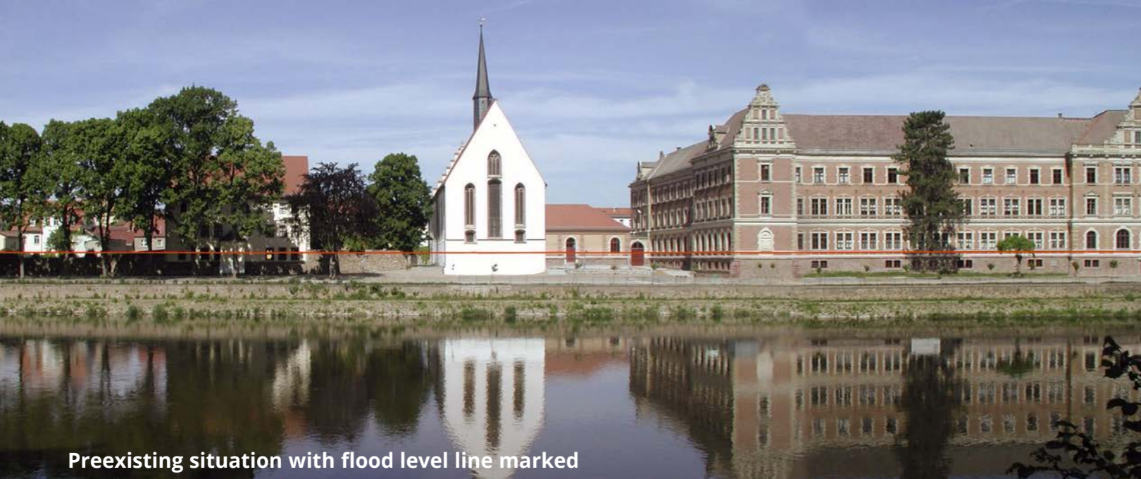
Preexisting situation with flood level line marked