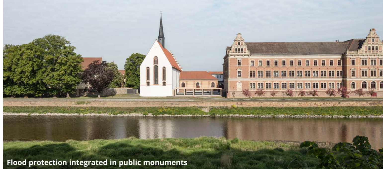
Flood protection integrated in public monuments