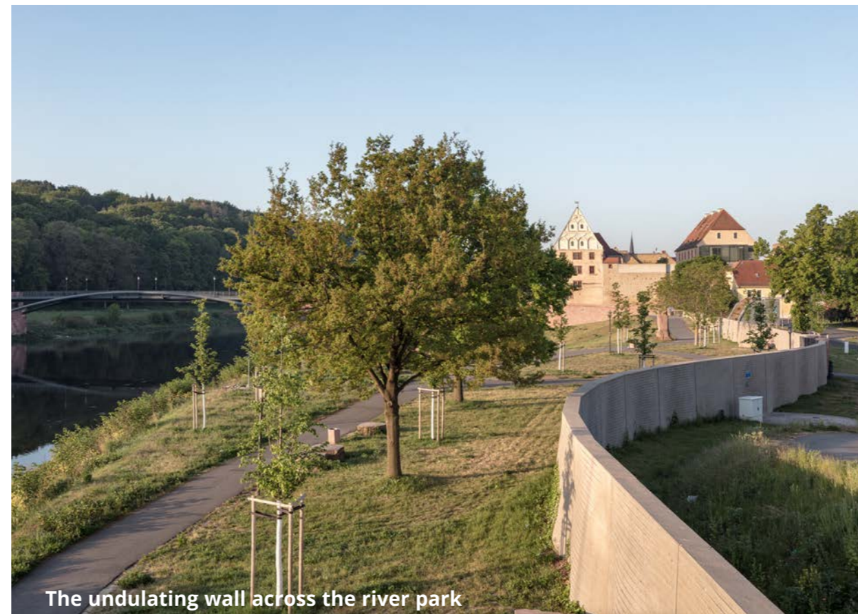
The undulating wall across the river park