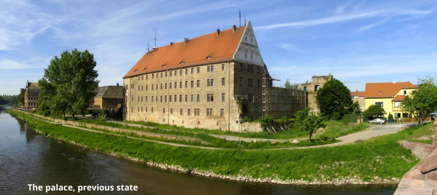
The palace, previous state