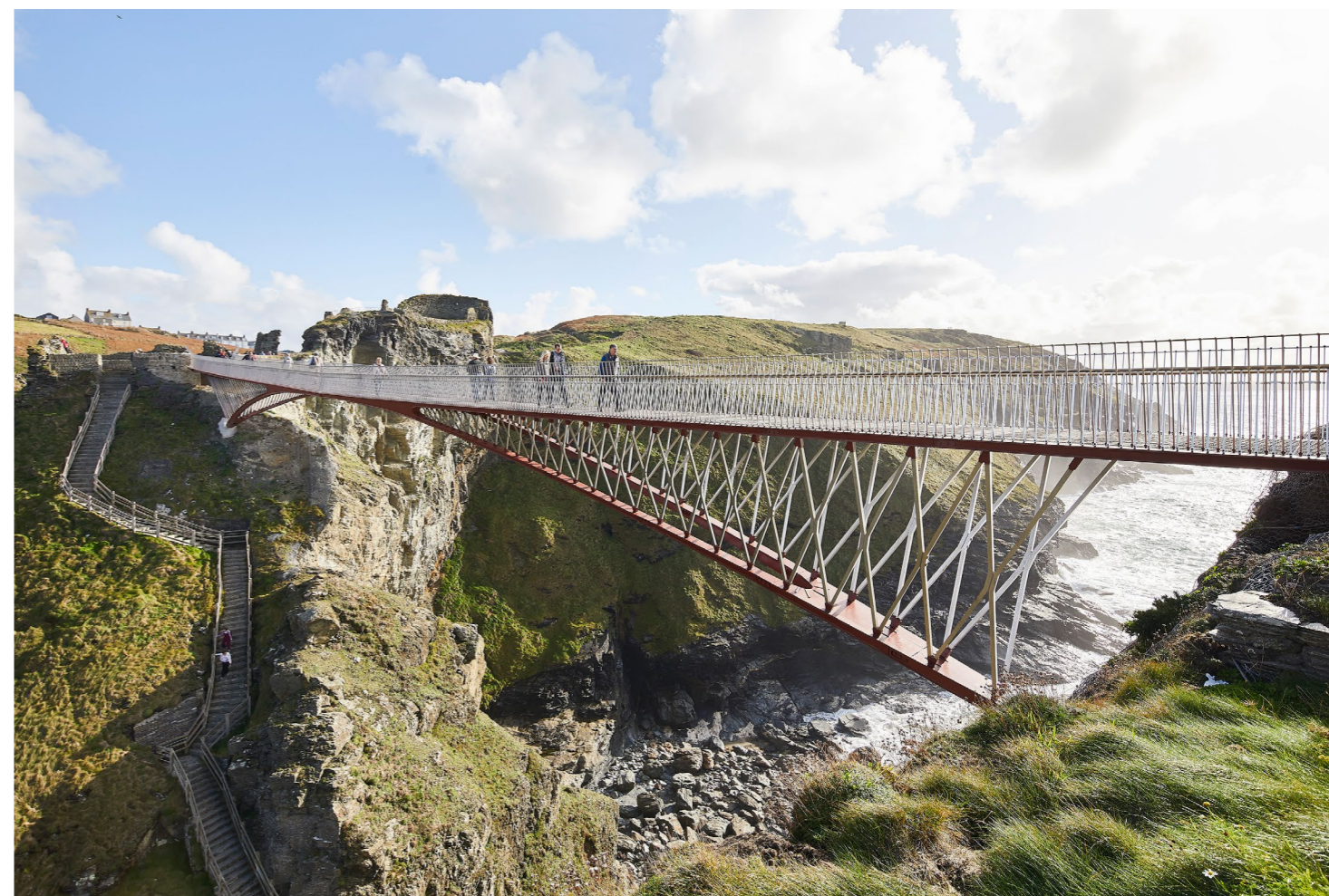
TINTAGEL FOOTBRIDGE, CORNWALL UK - Ney & Partners and William Matthews Associates - CATEGORY B