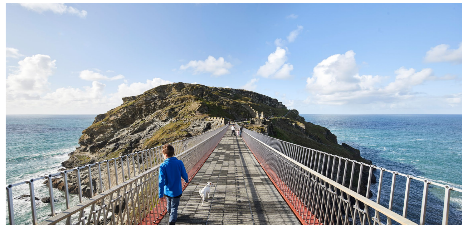
TINTAGEL FOOTBRIDGE, CORNWALL UK - Ney & Partners and William Matthews Associates - CATEGORY B