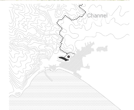
19th century. The infrastructural city Arrival of the water channel and settlement of the farmhouse on the San Cristobal hillside.