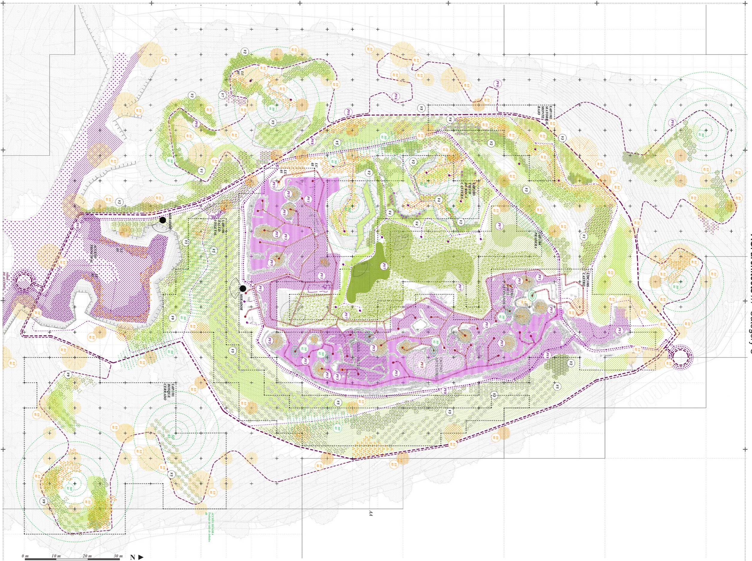
MONTE DO CASTRO /// General Plan